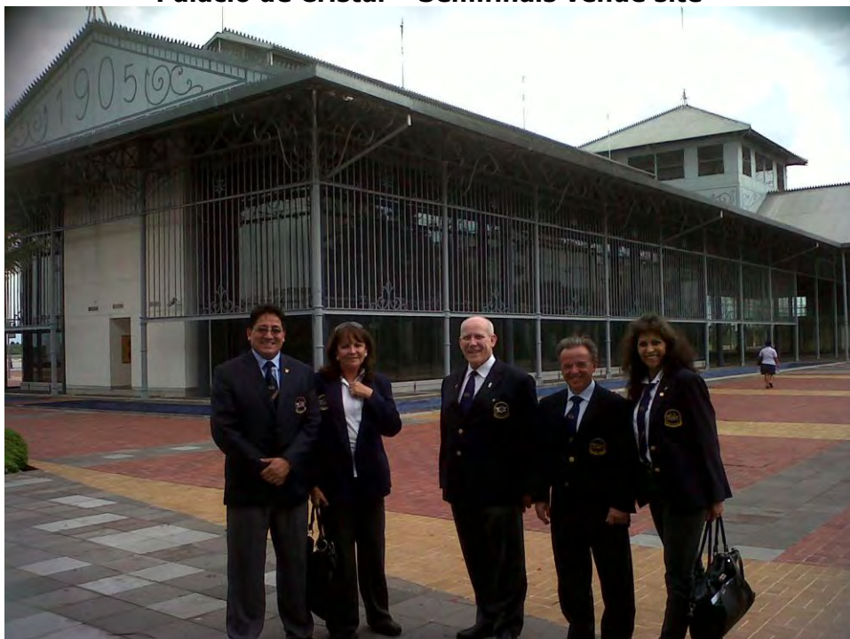
Palacio de Cristal – Semifinals venue site - Inspection Visit