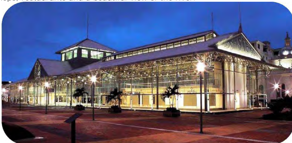
Palacio de Cristal – Semifinals venue site

The Championship Semifinals will take place at "Palacio de Cristal", located on Malecon and Olmedo Streets. It is a fantastic open area, but still covered and in the middle of the city where there are shops, restaurants and a beautiful view of the river.