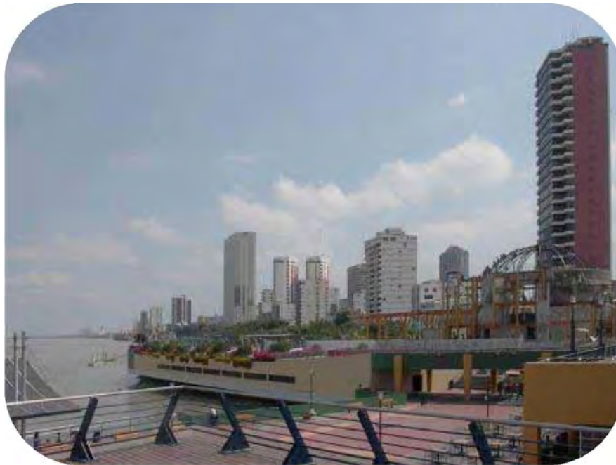
Partial view of Guayaquil's Port

The "Jose Joaquin de Olmedo" International Airport has served the city of Guayaquil since 2006. It is expected to reach an annual capacity of 5 million passengers soon. It connects Guayaquil with many countries and was named "Best Airport in Latin America 2008" by Business Week Magazine.