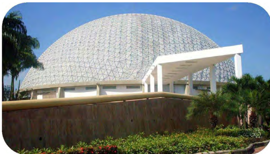
Eloy Alfaro Theater – Finals venue site