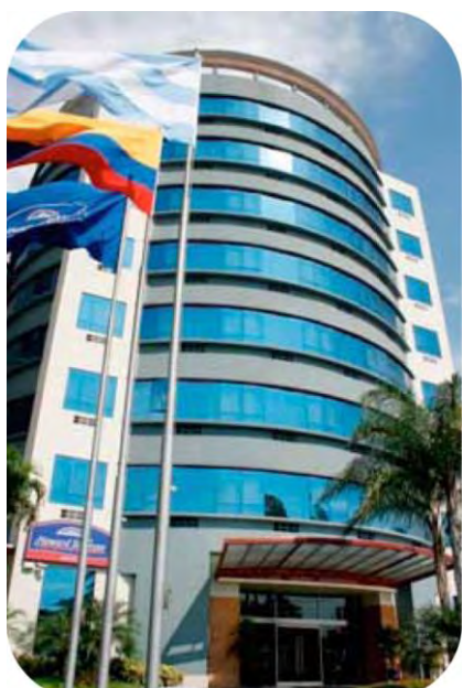
Howard Johnson Hotel

Any judge, coach, or trainer who is not an Official Participant will be responsible for all his expenses. If your National Federation wishes to bring a judge, a coach or a trainer, it is recommended that your Federation nominate this individual to be an Official participant for your Federation; otherwise, these individuals will be responsible for all their own expenses. The same rule applies for family members. NO EXCEPTIONS WILL BE MADE UNDER ANY CIRCUMSTANCES.