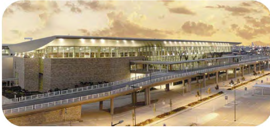
Partial exterior view of "Jose Joaquin de Olmedo" International Airport