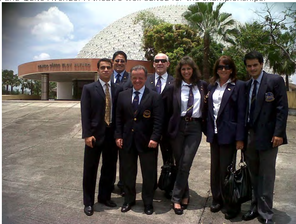
Eloy Alfaro Theater – Finals venue site – Inspection visit

The Finals will take place in the beautiful theatre "Teatro Centro Civico Eloy Alfaro", located on Bolivia Street and Quito Avenue. A theatre well suited for the championships.