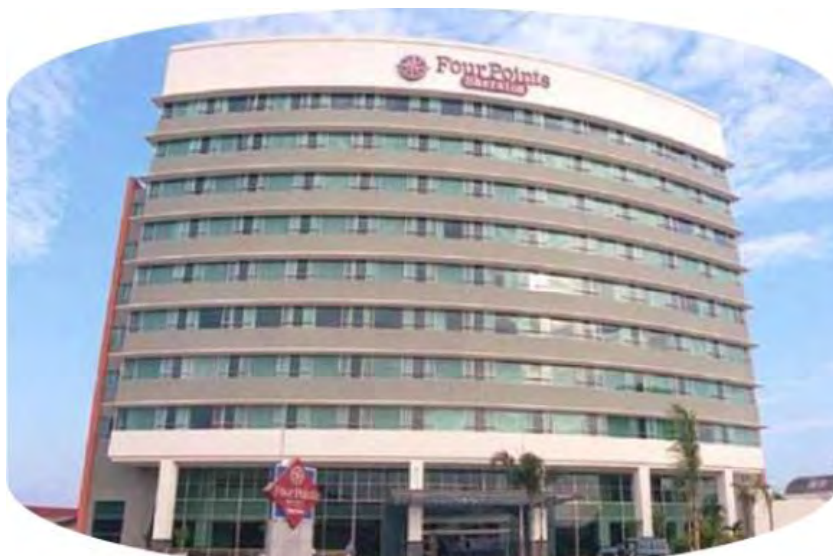
Four Points Sheraton