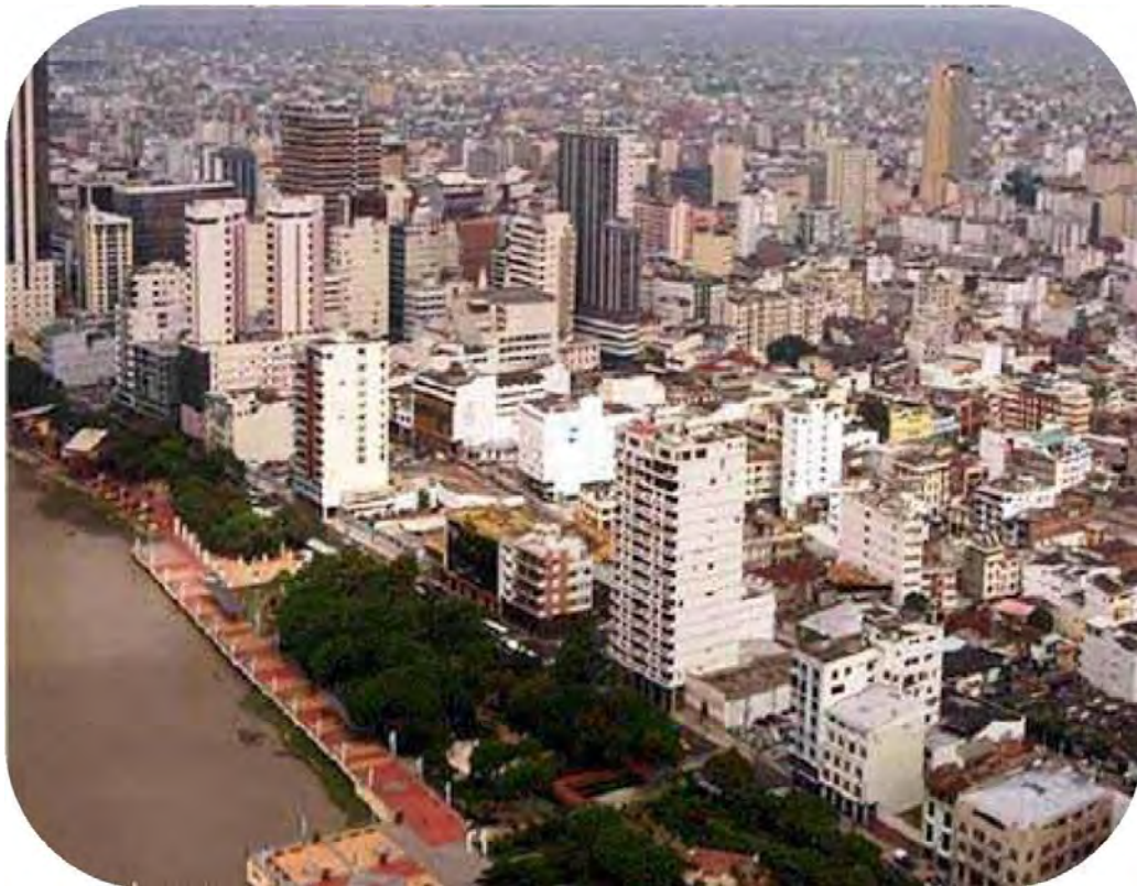
Aerial view of Downtown Guayaquil

The Organizing Committee of the Ecuadorian Bodybuilding and Fitness Federation takes this opportunity to welcome all National Federations of the world to participate in the 66th IFBB Men's World Amateur Bodybuilding Championships and International Congress in Guayaquil, Ecuador, 6th to 11th November 2012.